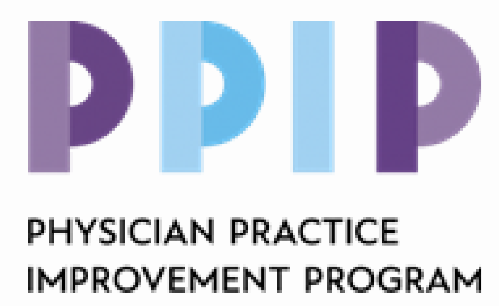
Figure 1. Physician Practice Improvement Program (PPIP) logo used by the College of Physicians & Surgeons of Alberta (CPSA) [1].