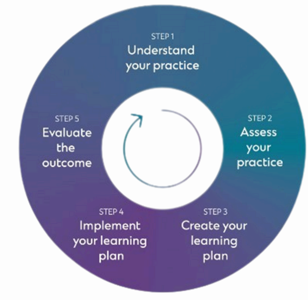
Figure 2. The Federation of Medical Regulatory Authorities Canada (FMRAC) system for practice improvement [1].